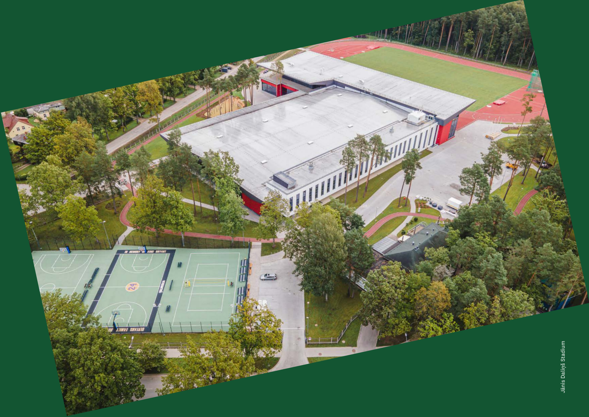
Jānis Daliņš Stadium