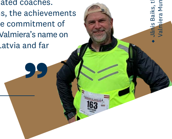
♦ Jānis Baiks, the Mayor of Valmiera Municipality Council