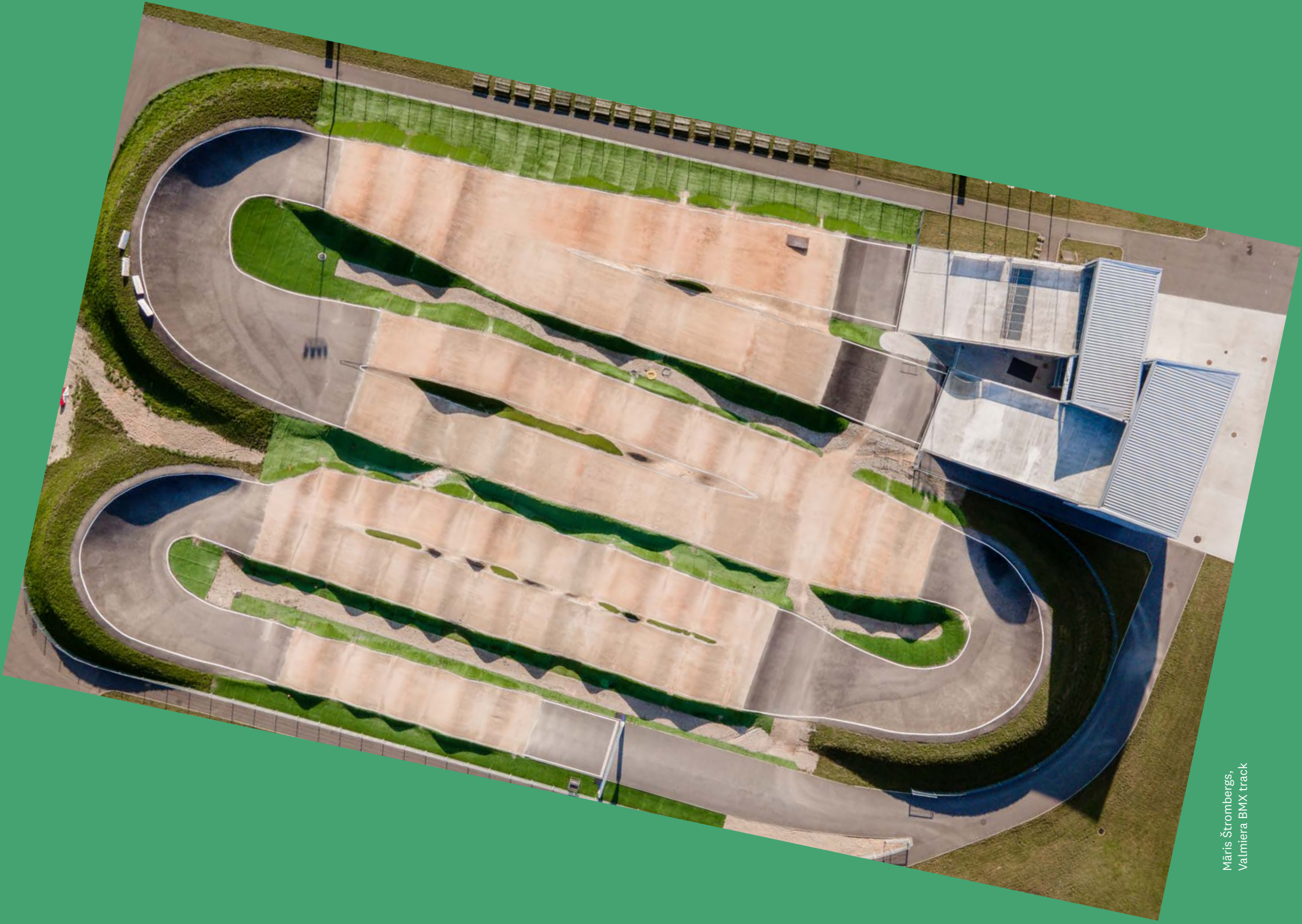
Māris Štrombergs, Valmiera BMX track